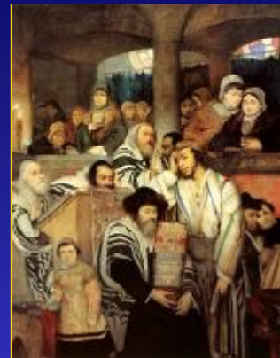
Jews praying in the Synagogue on Yom Kippur. (1878 painting by Maurycy Gottlieb)