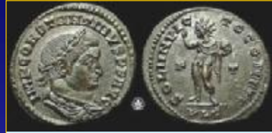
Coin of Constantine, with depiction of the sun god Sol Invictus on reverse side, with inscription: SOLI INVICTO COMITI, To (Constantine's) "companion, the unconquered Sol".