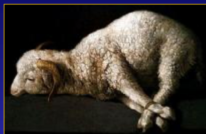
Agnus Dei - Francisco de Zurburán (1598-1664)

Stone Chumash commentary on Leviticus 16